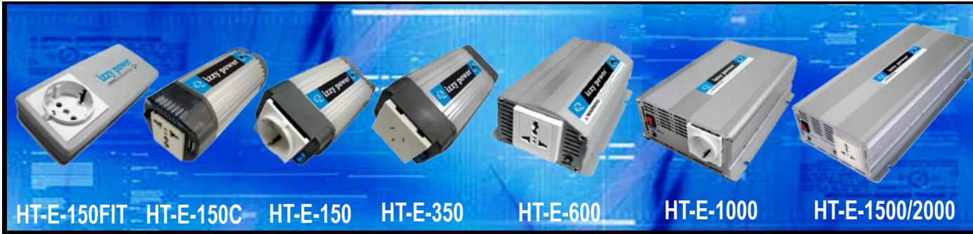
HT-E-150FIT HT-E-150C HT-E-150 HT-E-350 HT-E-600 HT-E-1000 HT-E-1500/2000