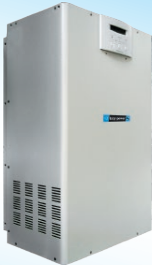
Remote control connector